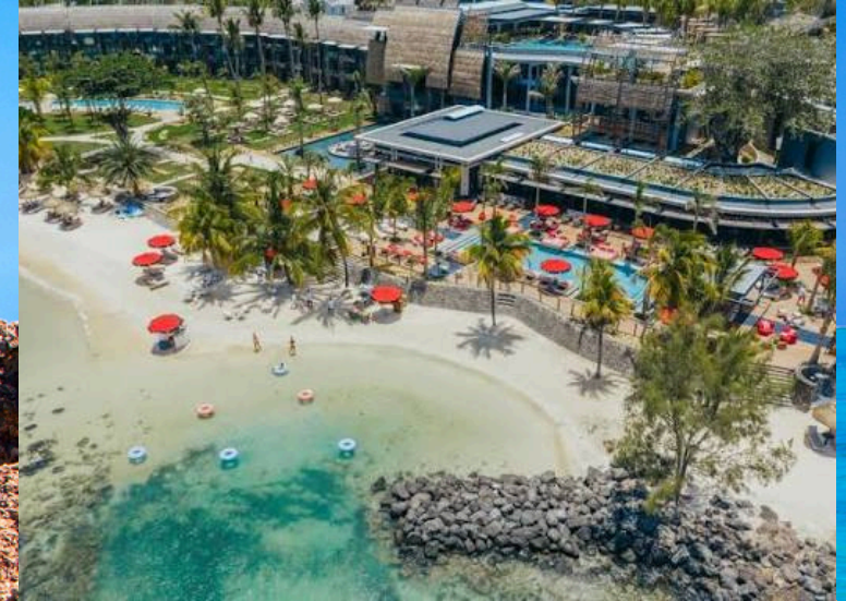
MERVILLE BEACH HOTEL

A relaxed, adults-friendly 4-star resort on the east coast, known for good value, beachfront access and a calm vibe particularly popular with couples. Offers a simple, comfortable stay with beach access, some water sports, and a peaceful setting without the high-end price tag of 5-star resorts. A solid choice if you want a beachfront escape that balances quality and affordability.