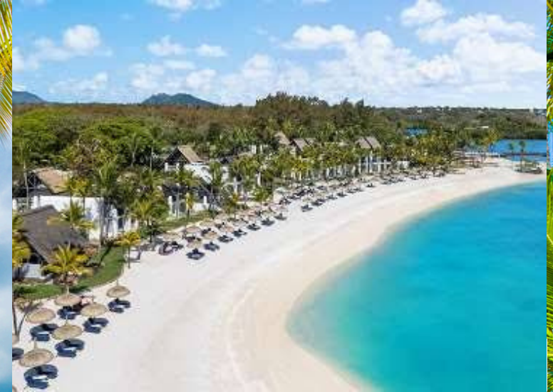
SHANGRI-LA LE TOUESSROK RESORT & SPA

Renowned for its elegant, tranquil atmosphere on a private peninsula often highlighted as one of the most luxurious stays in Mauritius. Highly rated for its refined hospitality, beautiful surroundings, and upscale amenities. A wonderful choice for those looking for a romantic getaway, luxury getaway, or a calm retreat away from the busiest tourist zones.