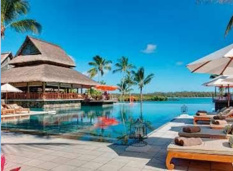
ONE&ONLY LE SAINT GÉRAN

Arguably the most iconic luxury resort on the island . Located on a private peninsula on Mauritius's northeast coast. Offers over a mile of pristine palm-lined white-sand beach, a calm lagoon, luxurious rooms and villas, a top-notch spa and excellent restaurants. Great for honeymooners, couples and anyone wanting private beach luxury, peace, and high-end service.