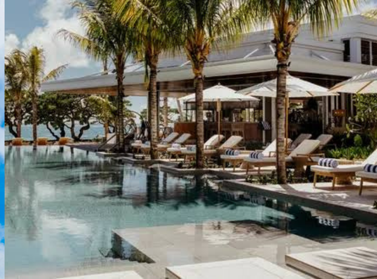
CONSTANCE PRINCE MAURICE

Arguably the most iconic luxury resort on the island . Located on a private peninsula on Mauritius's northeast coast. Offers over a mile of pristine palm-lined white-sand beach, a calm lagoon, luxurious rooms and villas, a top-notch spa and excellent restaurants. Great for honeymooners, couples and anyone wanting private beach luxury, peace, and high-end service.