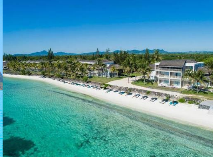
SOLANA BEACH MAURITIUS

A stylish 4-star resort with a relaxed, authentically Mauritian vibe ideal for travellers who want “affordable comfort + charm.” Great if you enjoy a mix of beach time, local culture (they offer cultural activities), and a friendly, less “posh resort” atmosphere. Good for couples or small groups who want decent amenities without luxury-resort prices.