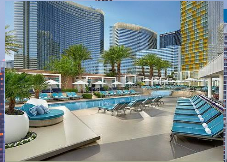
WALDORF ASTORIA LAS VEGAS

The Cosmopolitan of Las Vegas is a luxury resort, casino, and entertainment complex situated at the heart of the Las Vegas Strip. Opened in 2010, it is renowned for its modern, vertical design offering panoramic terrace views and a vibrant mix of hospitality, nightlife, and culture within its twin high-rise towers.