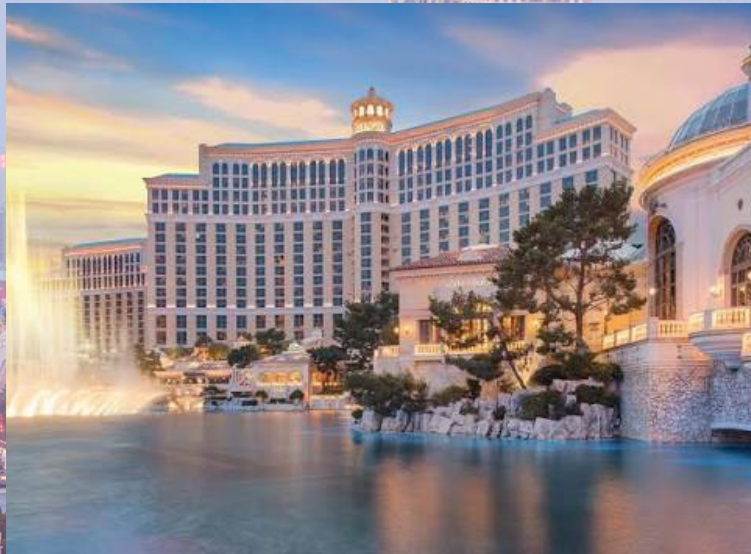
BELLAGIO HOTEL & CASINO

Bellagio Hotel & Casino is a luxury resort and gaming complex on the Las Vegas Strip in Paradise, Nevada. Known for its elegance and the iconic Bellagio Fountains, it epitomises the opulence and grandeur of modern Las Vegas hospitality and entertainment. The property is operated by MGM Resorts International and remains one of the city's most recognisable landmarks.