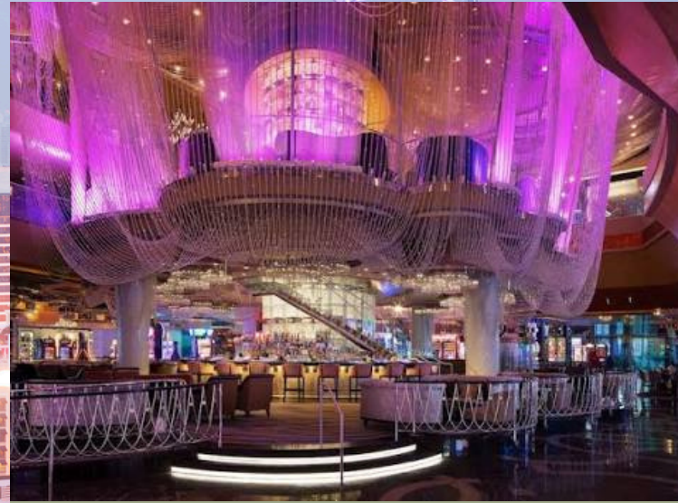
THE COSMOPOLITAN OF LAS VEGAS

Wynn Las Vegas is a luxury resort and casino located on the northern end of the Las Vegas Strip. Owned and operated by Wynn Resorts, it represents one of the most opulent and architecturally refined properties in Las Vegas, renowned for setting benchmarks in hospitality, design, and entertainment since its opening in 2005.