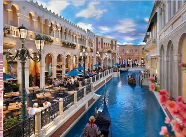
THE VENETIAN LAS VEGAS

Bellagio Hotel & Casino is a luxury resort and gaming complex on the Las Vegas Strip in Paradise, Nevada. Known for its elegance and the iconic Bellagio Fountains, it epitomises the opulence and grandeur of modern Las Vegas hospitality and entertainment. The property is operated by MGM Resorts International and remains one of the city's most recognisable landmarks.