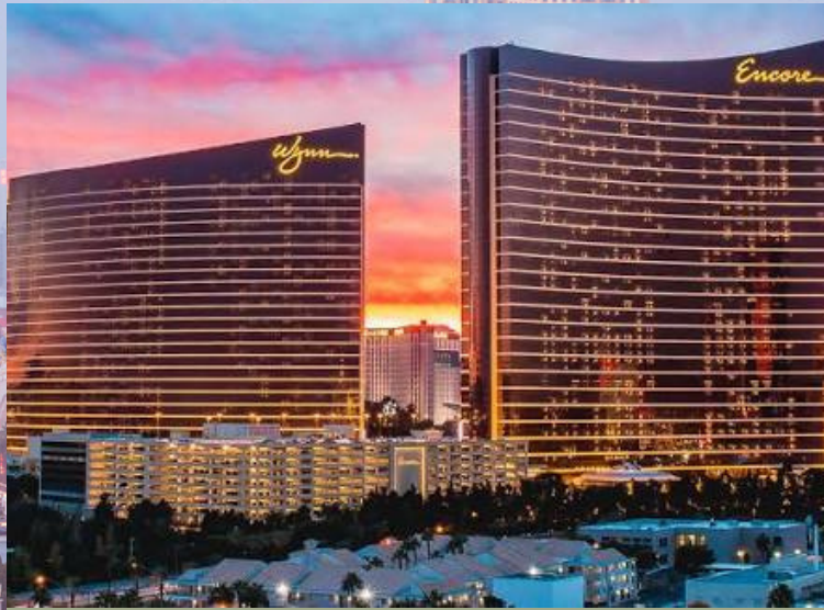
WYNN LAS VEGAS

Wynn Las Vegas is a luxury resort and casino located on the northern end of the Las Vegas Strip. Owned and operated by Wynn Resorts, it represents one of the most opulent and architecturally refined properties in Las Vegas, renowned for setting benchmarks in hospitality, design, and entertainment since its opening in 2005.